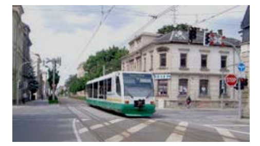
Triple-rail track, Zwickau

Tram-trains, compared with buses, can be easier to access and use, have permanent routes that encourage the development of a community's transit orientation, and can carry more people in regular services. Bus routes using roads might be more flexible, but to run faster and more smoothly and to carry more people, they need